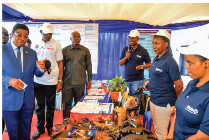
The Prime Minister, Hon. Kassim Majaliwa listening to a testimony from THPS- Global Fund AMREF Mlango Project's beneficiary

The Prime Minister of the United Republic of Tanzania, Hon Kassim Majaliwa who was the Guest of Honor on the World AIDS Day event visited THPS stall and commended THPS efforts in supporting behavioral changes among vulnerable populations in Tanzania.