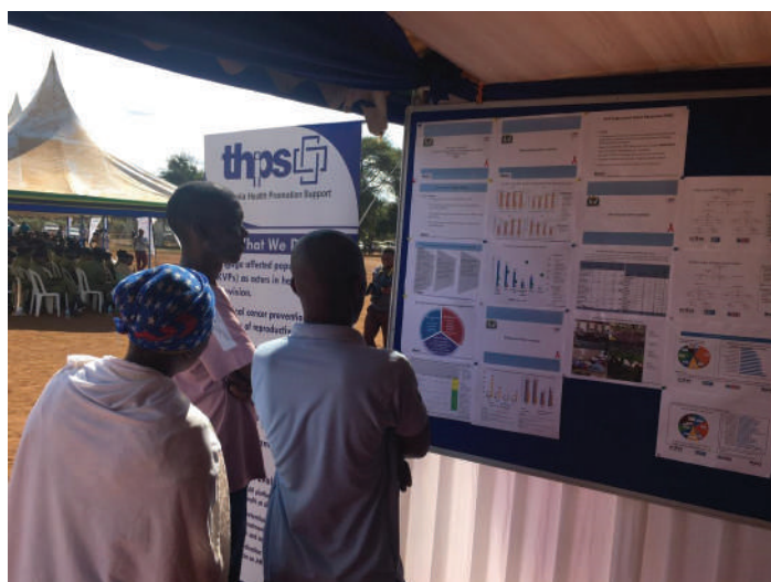
Visitors reading information on THPS implemented activities

In late November, 2020, THPS through support from PEPFAR, CDC, USAID, and the Global Fund joined other national Stakeholders to commemorate the International World AIDS Day week marked at Mandela grounds in Moshi Municipality, Kilimanjaro Region, with the theme: Global solidarity; shared responsibility. THPS booth was visited by over 130