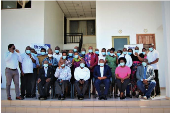
Health authorities from Tanzania Police Force medical Unit Dar es Salaam meeting

On December 8th 2020, THPS through support from USAID/Presidents Emergency Plan for AIDS Relief (PEPFAR) conducted USAID Police and Prisons Activity's introductory meetings to officials from Police Medical Unit (PMU) in Dar es Salaam; and Tanzania Prisons Health and Nutrition Unit on December 17th 2020 in Dodoma City. In both meetings, the Year 1 Activity Implementation plan was jointly reviewed with the Police and Prisons health authorities that included their zonal representatives.