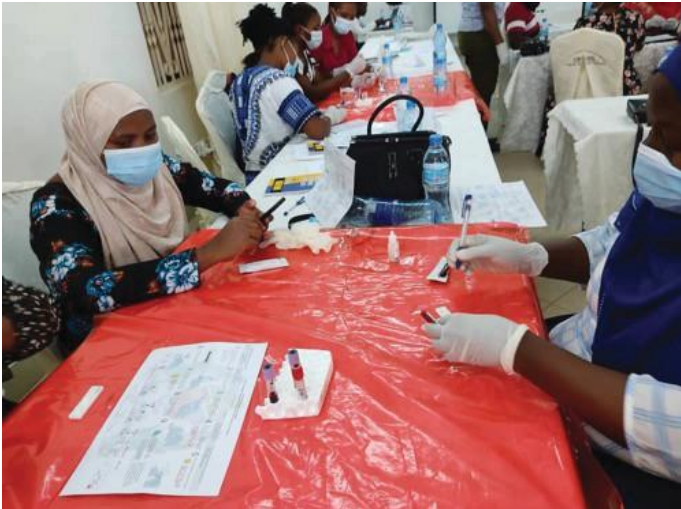
Practical session on HIV/Syphilis Dual testing

Twenty four health care workers in Pwani region received the Ministry of Health, Community Development, Gender, Elderly and Children three days training on HIV/Syphilis Dual testing; with support from THPS through PEPFAR CDC Afya Kwanza Program in June 2021 at Kibaha Town Center.