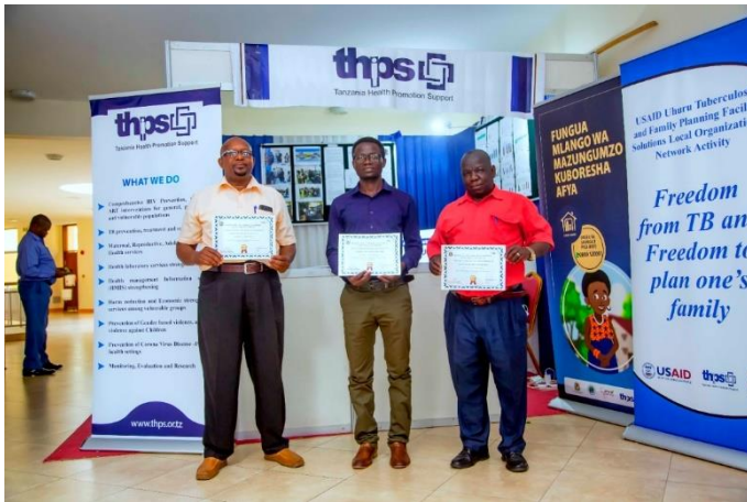
From Right to left, Rukwa, Kigoma and Katavi's Regional TB and Leprosy Coordinators holding their certificates of appreciation from NTLP

For its first financial year one (October 2020 to September 2021), overall 4,429 new TB cases were notified an increase of 23% from TB cases notified the year before commencement of USAID Uhuru TB & FP LON Activity support i.e. 3,426 cases. In addition, the new TB notified cases during the first financial year surpassed the national target of 3,956 cases for the year. Pediatric TB case notification also surpassed the national target of 15% whereby 18% of the notified cases were children. A total of 23 DR-TB cases were notified during this reporting period reflecting annual performance of 64%.