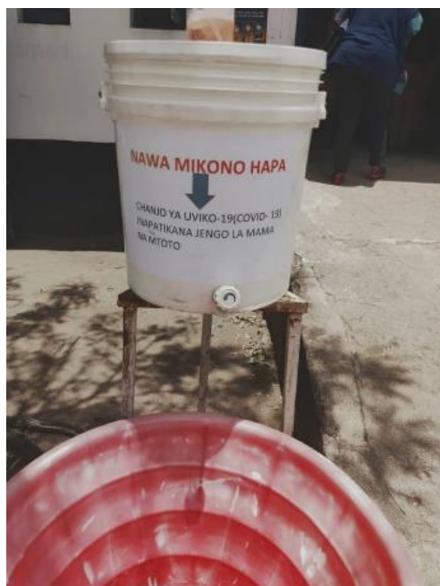
COVID -19 Vaccination signage at health facilities

As of 12 th December, 2021, 22, 247 (21%) PLHIV in Tier 1 & 2 health facilities were vaccinated; 133 (96%) community health workers (CHWs)/ lay counselors/ peer educators and 462 (100%) of supported HC were vaccinated, and increased from 41% in October, 2021. 98% of THPS 234 staff are also fully vaccinated.