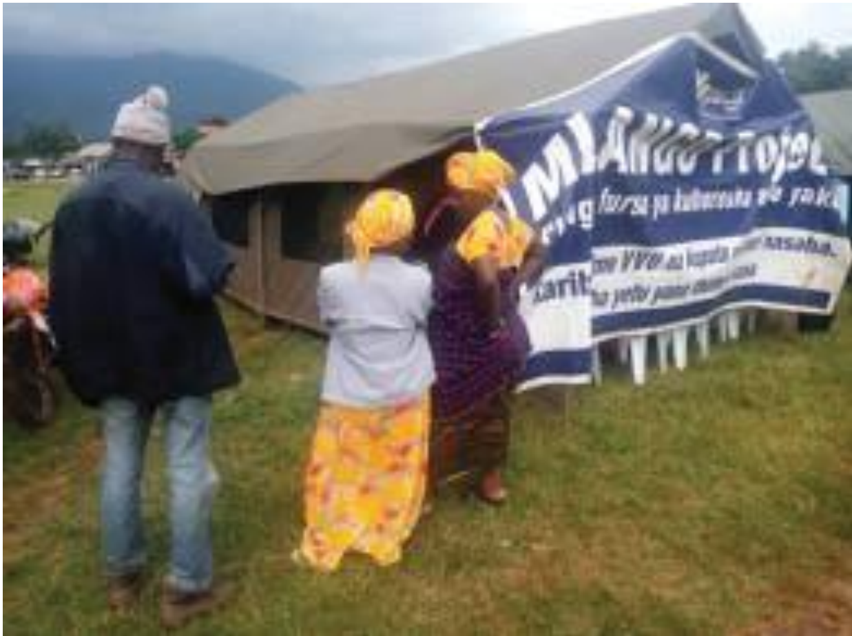
HIV testing services at the ground