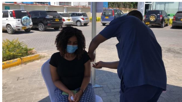
One of THPS staff getting vaccinated

In collaboration with regional and Council health management teams (RCHMTs) in Kigoma, Pwani and Shinyanga regions, THPS have scaled up COVID -19 vaccination from 1 st October 2021 to date. This is a continuous acceleration effort in supporting Tanzanian government.