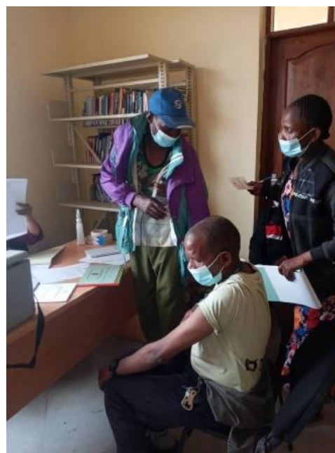
A HCW in Manyara getting vaccinated during training