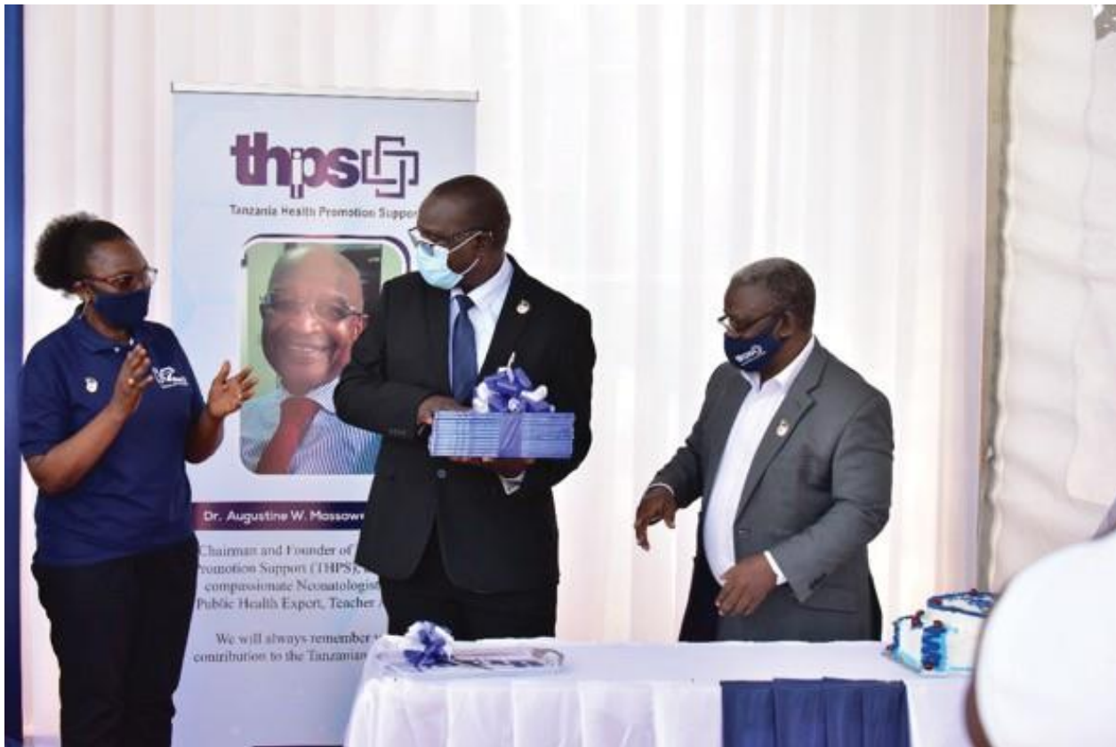
Symbolic launch of THPS Strategic Plan (2021-2025)